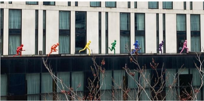
Photo Challenge: Look out for 7 running figures on the roof of the Hilton Hotel. Take a photo of you and your team recreating your favourite pose!