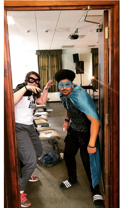
A few of the villains we had to catch...

April is set to be a quieter month, but please continue to pray for: