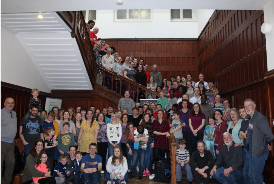
Everyone was still smiling on Sunday morning!