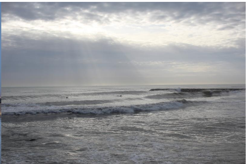
Surfers and stormy day Puzol Beach